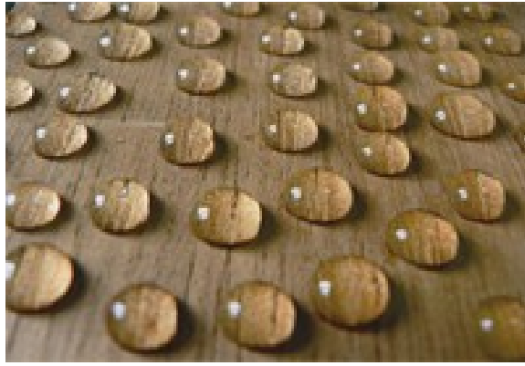
Characteristic appearance of a hydrophobic nano-treated wood surface