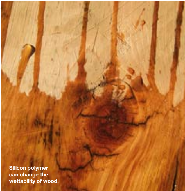
Silicon polymer can change the wettability of wood.

However, the UV irradiation appears to change surface yellowness of coniferous species more than hardwood species. The anti-UV treated hardwood surfaces (chestnut and cherry) yielded higher gloss than the anti-UV treated softwoods (pine and fir).